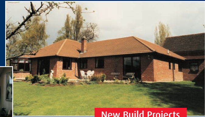
New Build Projects